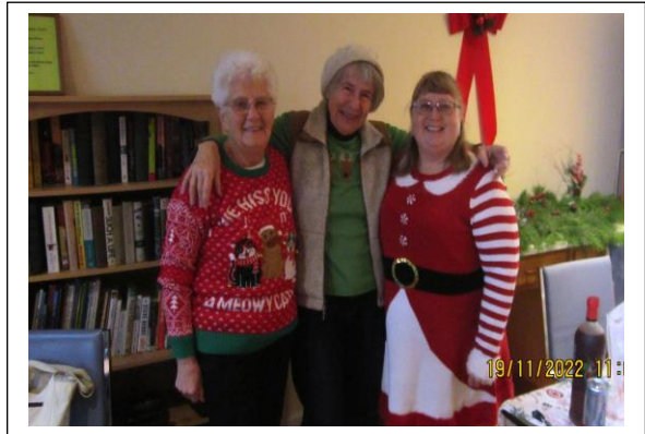
THE THREE MUSKETEERS?

OVERHEARD IN THE NARTHEX A Sunday school teacher asked her children as they were on the way to church service, "And why is it necessary to be quiet in church?" One bright little girl replied, "Because people are sleeping."