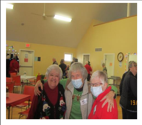
THE THREE STOOGES?

OVERHEARD IN THE NARTHEX A Sunday school teacher asked her children as they were on the way to church service, "And why is it necessary to be quiet in church?" One bright little girl replied, "Because people are sleeping."