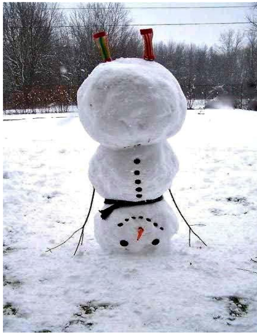
DO YOU EVER HAVE DAYS LIKE THIS?

Three Wise Women Would have asked directions Arrived on time Helped deliver the baby Brought practical gifts Cleaned the stable Made a casserole and there would be Peace on earth!